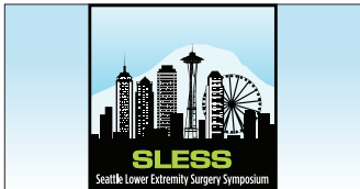
Exhibit Sponsor: $650* Speaker Sponsor: $2,500-$6,000*