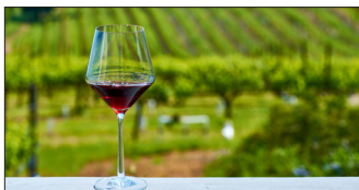
Exhibit Sponsor: $950* Meal Sponsor: $5,000** Welcome Dinner Sponsor: TBD