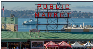
Exhibit Sponsor: $750* Speaker Sponsor: $2,500-$6,000*