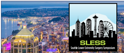
Exhibit Sponsor: $750* Speaker Sponsor: $2,500-$6,000▲